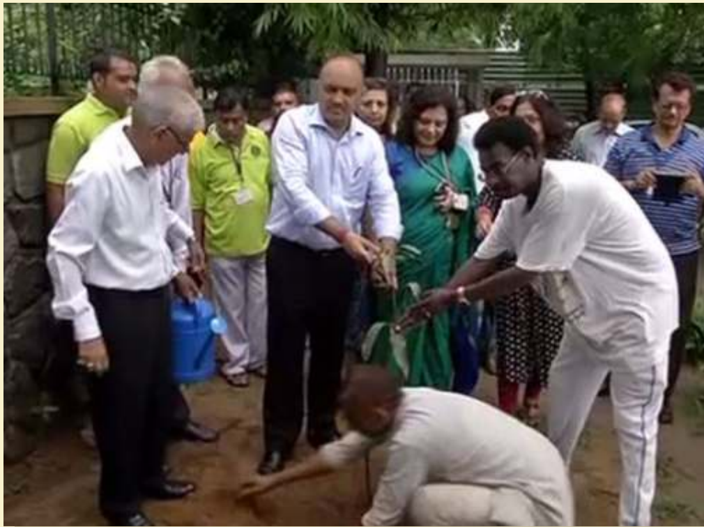
Plantation Drive at Ambassadors Place