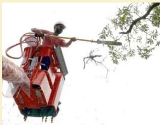
Tree Cutting Machines of NDMC