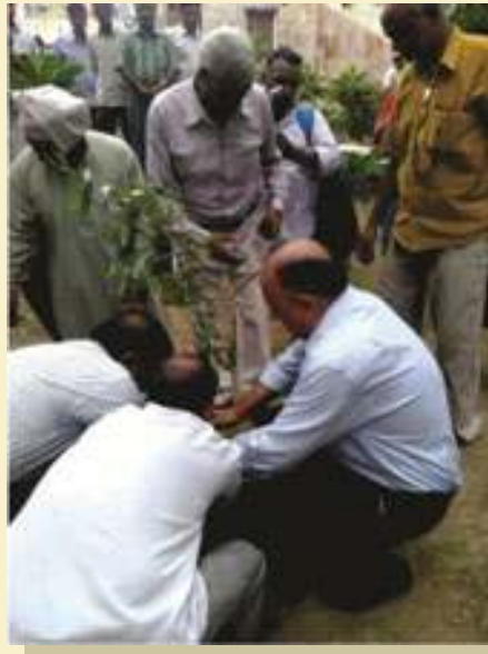
Photo Shows : NDMC Chairman planting a sapling of 'Rudraksha' in memory of Shaheed Chandrashekhar Azaad at Shaheed Bhagat Singh Place, New Delhi- 23/7/2016