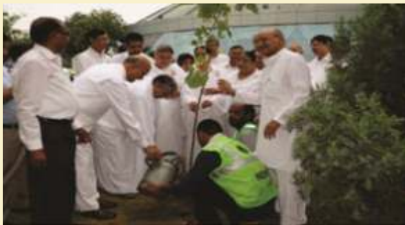
Photo Shows : Brahmakumaris planting saplings at Talkatora Stadium premises- 24/7/2016