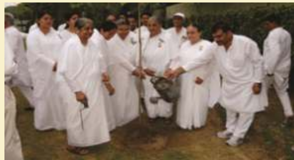
Photo Shows : Brahmakumaris planting saplings at Talkatora Garden- 24/7/2016

NDMC plants 27000 saplings at 14 Circle of New Delhi area About 5000 NDMC work force participated in the plantation drive