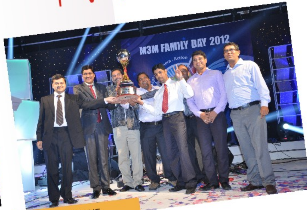
WINNERS OF THE BEST MAINTAINED PROJECT SITE AWARD