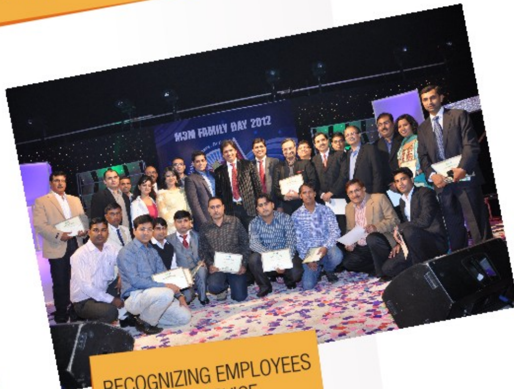
RECOGNIZING EMPLOYEES FOR LONG SERVICE