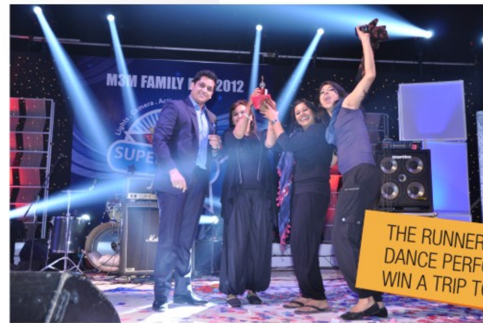
THE RUNNERS-UP OF DANCE PERFORMANCE WIN A TRIP TO GOA