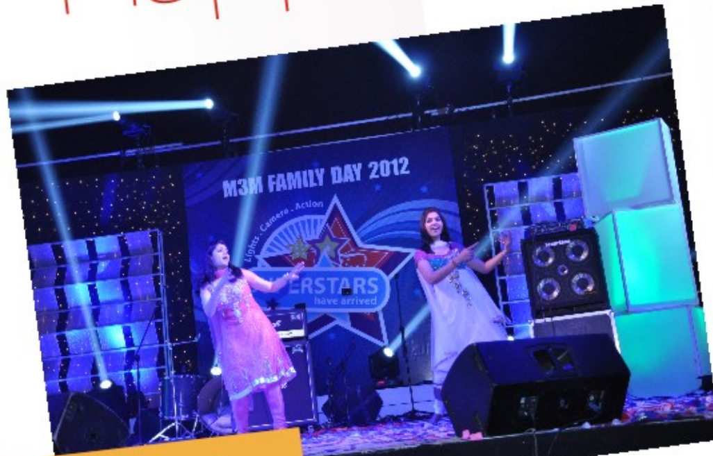
THE SUPERSTARS OF M3M WIN A TRIP TO DUBAI